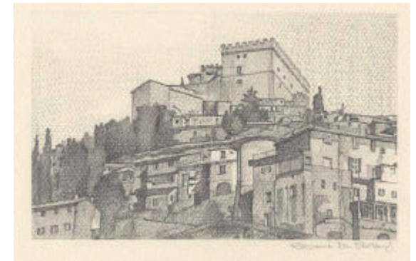
Veduta a nord del castello e di una parte del paese

The old town dwellings are all around the castle, still in good shape, with the narrow alleys crisscrossing irregularly.