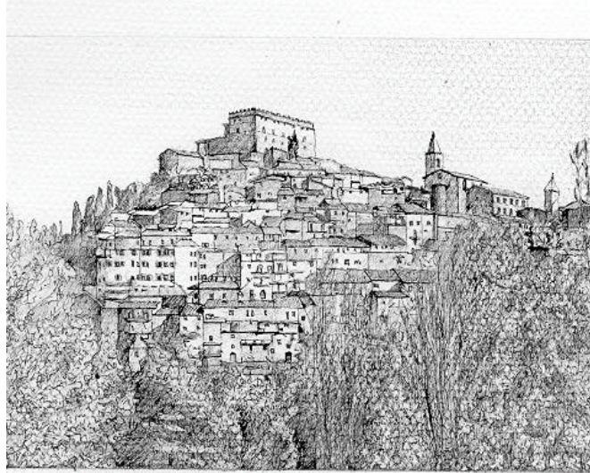
Veduta panoramica del paese

Then it was owned by Cristoforo Madruzzo that embellished the town with the Papacqua Spring (Queen of waters) with a set of statues and a mansion projected by Vignola.